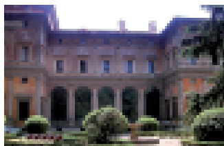
ACCADEMIA DEI LINCEI PALAZZO CORSINI Via della Lungara 10, Roma