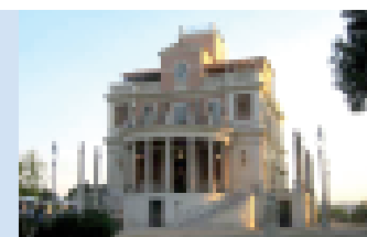
GALA DINNER 28 May Location: Casina Valadier Piazza Bucarest - Roma